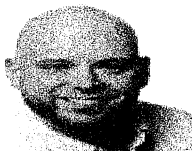
image002.jpg 3 KB